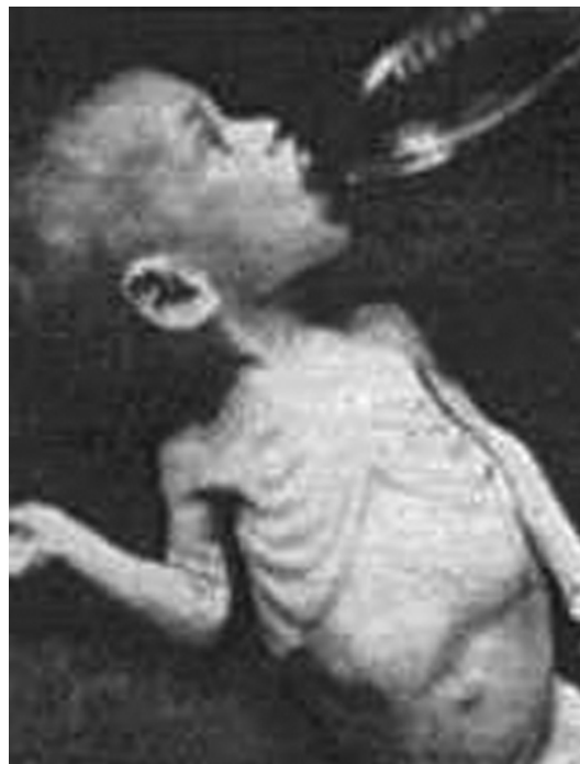
Figure 1 Infant with pyloric stenosis.

Hirschsprung reported two cases. The first, a girl, was born at term and began violent vomiting