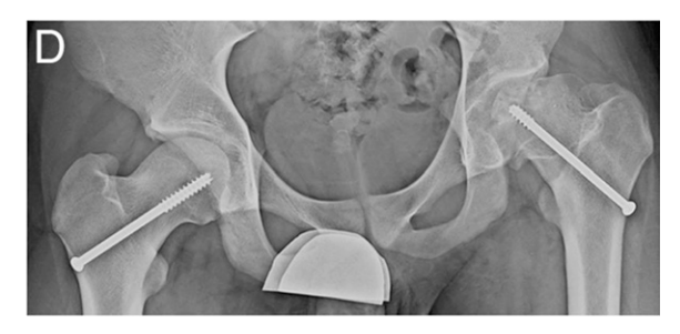
Figure 5D. Anteroposterior pelvis radiograph of a 20-year-old man with severe left hip pain. He had been treated for an unstable slipped capital femoral epiphysis at age 14 but was lost to follow-up. The image reveals incomplete avascular necrosis of the left hip and premature osteoarthritis.

Downloaded from http://publications.aap.org/pediatricsinreview/article-pdf/36/5/184/824513/pedsinreview_20140068.pdf bv Univ of Tennessee - Memphis user