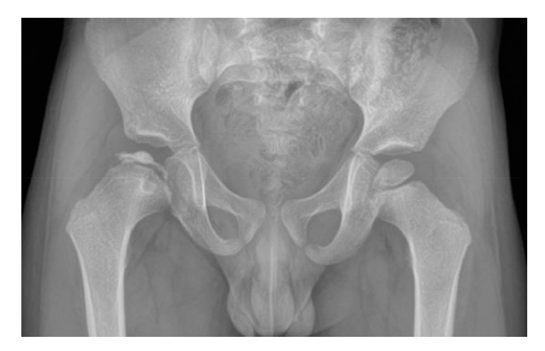
Figure 4. Anteroposterior radiograph of the pelvis of a 4-year-old boy who was intermittently limping for 3 months. The right hip has severe flattening of the femoral epiphysis with sclerosis consistent with advanced Legg-Calvé-Perthes disease.

SCFE is displacement of the proximal femoral (capital) epiphysis from the metaphysis of the femur caused by an abnormality of the physis. The physis is structurally weakened, leading to displacement or slipping, because of endocrine and metabolic conditions, such as hypothyroidism and renal osteodystrophy, or because of excessive or abnormal mechanical stresses, referred to as idiopathic SCFE, the most common type. SCFE occurs most commonly in older children and adolescents between the ages of 10 and 14 years, in obese children, in certain populations such as Pacific Islanders, and in males more often than females. Stable SCFE (defined as one in which the child is able to bear weight), when managed properly, generally has