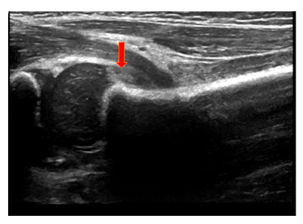
Figure 3. Ultrasonographic image of the right hip of an 11-month-old who stopped cruising and was in pain when her diaper was changed reveals a moderate hip effusion. In the emergency department she had a temperature of 102.2°F (39°C), a CRP of 4 mg/L (38.1 nmol/L), and ESR of 62 mm/h. The hip was aspirated in the ultrasonography suite. After pus was aspirated, she went urgently to the operating room for open surgical drainage.

*C-reactive protein added by Caird et al; not part of the original Kocher criteria.