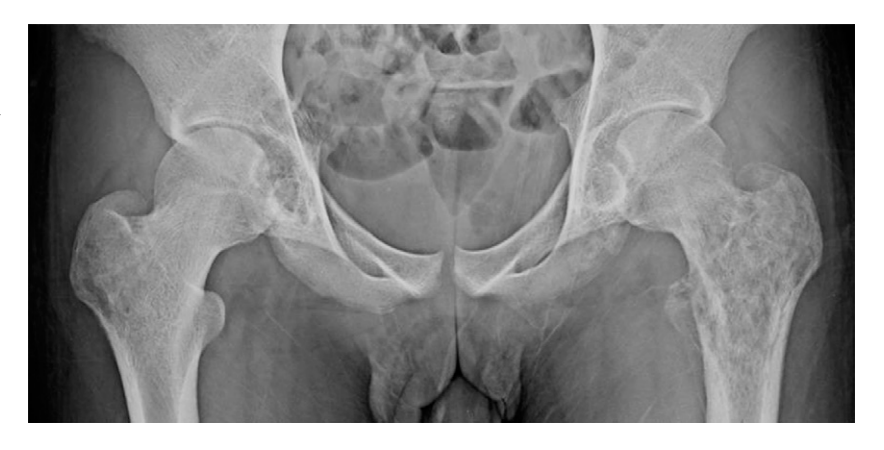
Figure 8. Anteroposterior pelvis radiograph of a 14-year-old boy with intermittent fevers, bilateral hip pain, and a left-sided limp. The image reveals a lytic irregular lesion in the left proximal femur and a pathologic fracture of the lesser trochanter as well as a small lesion in the right greater trochanter. Bone marrow biopsy revealed lymphoma.