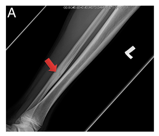
Figure 7A. Lateral radiograph of the tibia and fibula for 12-year-old boy with chief complaints of a limp and pain at night for the past 3 months in his left lower extremity. The image demonstrates a cortical thickening in the fibula (arrow).

Benign neoplasms and malignancies are uncommon causes of limping. Presentations of these conditions can vary widely.