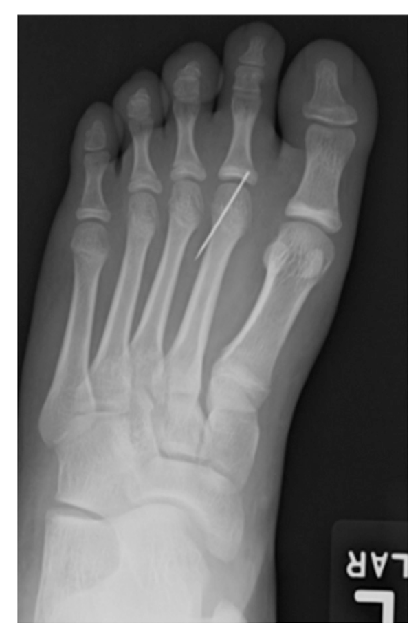
Figure 2. Anteroposterior radiograph of the foot reveals a retained sewing needle that the mother had tried to remove 2 days ago. The foreign body was removed in the operating room.

Bacterial infections of the lower extremities are common and have a wide range of clinical manifestations. Musculoskeletal infections include local cellulitis, fasciitis, myositis, septic arthritis, osteomyelitis, and especially in the era of MRSA, extensive infections that involve soft tissues, bone, and joints simultaneously. Septic arthritis of the hip is the most critical diagnosis that must not be missed acutely because damage to hip cartilage and the blood supply to the femoral head begins within 6 to 12 hours of infection onset and may be irreversible after 1 to 2 days. The infection, especially early in its course, may be difficult to diagnose. In general, musculoskeletal infections typically present with a painful limp or inability to bear weight and a fever. Depending on the area involved and the type of infection, local swelling and tenderness, erythema, joint effusions of