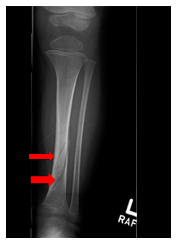
Figure 1. Anteroposterior radiograph of a 14-month-old boy who stopped walking after a fall from a sliding board reveals a nondisplaced spiral fracture of the tibia, also known as a "toddler fracture." He was treated in a cast for 4 weeks.

Foot Fractures. Nondisplaced fractures of the metatarsals and phalanges of the toes are common injuries in children that may cause limping. A twisting injury to the foot and stubbing of the toes are the most common mechanisms of injury. Point tenderness, focal swelling, and ecchymosis are typical findings. Most may be treated symptomatically with a hard-sole shoe or, in some cases, a cast. One foot injury, the Seymour fracture of the great toe, however, is frequently misdiagnosed and may be problematic. This displaced fracture of the great toe distal phalanx at the physis results from stubbing the great toe. The injury typically presents with bleeding at the proximal edge of the nail or disruption of the nail. Because the fracture partially reduces in most cases and is concealed by the infolded nailbed, this open fracture is often missed. Ideally, treatment includes removal of the nail, irrigation and debridement with fracture