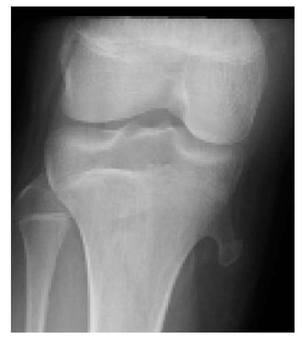
Figure 6. Anteroposterior radiograph of the knee in a 12-year-old boy with occasional medial knee pain and snapping. The image reveals pedunculated osteochondroma of the proximal tibia medially that was excised in the operating room.

diagnosis is not clear or who fail to respond to conservative measures.