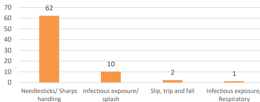
UTHSC Medical Resident Injuries, 2019

Respiratory exposure to infectious disease decreased from seven incidents in 2018 to one incident in 2019. Such exposures may be addressed through proper use of N95 respirators.