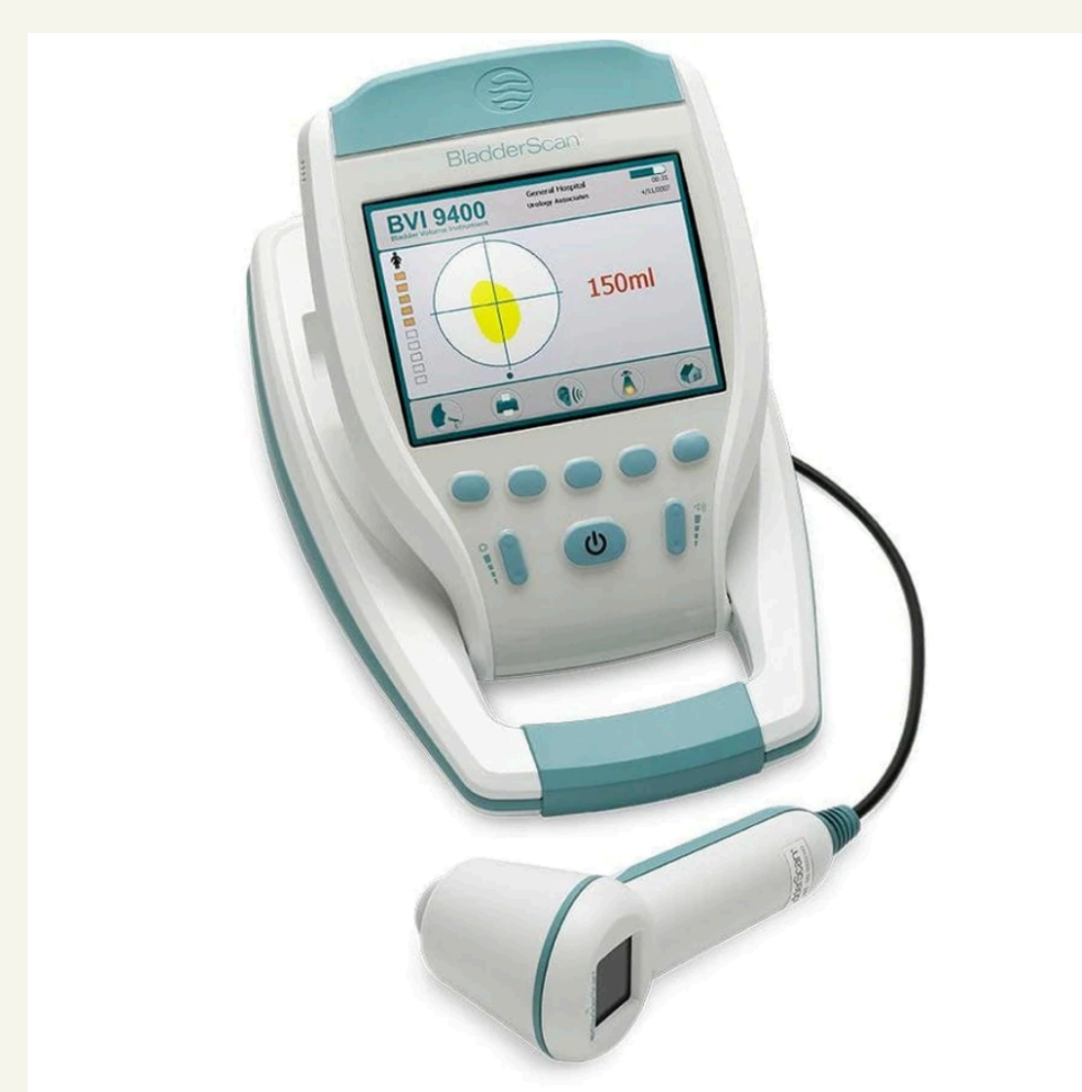
Verathon BLADDERSCAN BVI 9400