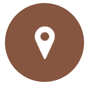
AIM is located in the Medical Mall on Elevator B Suite 601