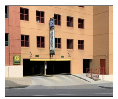
Locust St. (west) entrance of Locust Garage

Use reserved clinic spaces for Audiology and Speech, located on the 3<sup>rd</sup> level of the Locust Garage. A parking permit IS NOT required for these spaces . Your garage parking ticket will be validated upon arrival to your appointment.