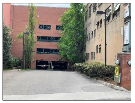
Walnut St (east) entrance of Locust Garage