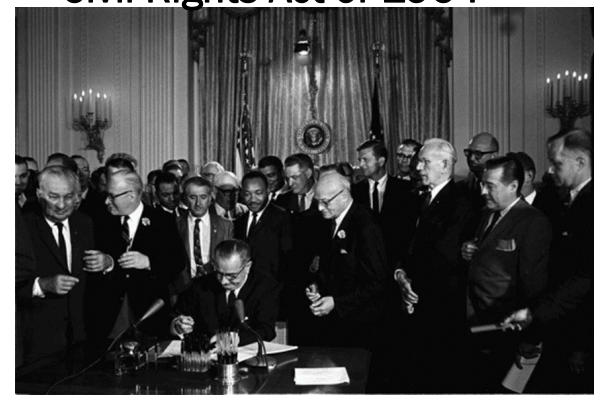
Lyndon B. Johnson signs the 1964 Civil Rights Act as Martin Luther King, Jr., others look Advocates on. 7/2/64. Such as

On July 2, 2014, our country will celebrate the 50<sup>th</sup> anniversary of the Civil Rights Act of 1964 . This act was originally introduced as the Civil Rights Act of 1963 by President John F. Kennedy, but he was unable to garner enough support in Congress. After the assassination of Kennedy, President Lyndon B. Johnson was able to rally supporters to give the bill the attention that civil rights groups and many Americans longed for. The new law outlawed discrimination based on race, color, religion, sex, and national origin in schools and public places. Additionally, the law established Title VII, which provides equal opportunity in employment.