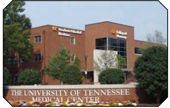
College of Pharmacy's Knoxville building is complete.

College of Pharmacy officials also gathered in August to witness the opening of the new building in Knoxville. This new option for second- to fourth-year pharmacy students to study in Knoxville is designed to help head off the statewide shortage of pharmacists. The 15,000-square-foot Knoxville building will increase the number of qualified pharmacists entering the job market in East Tennessee.