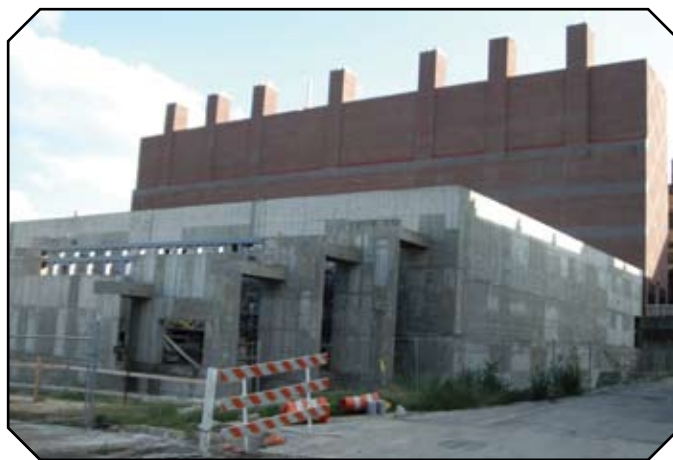
Construction of UTHSC's Regional Biocontainment Lab continues.

The RBL team leaders are making themselves available to attend campus staff meetings, as well as meet with community organizations, to address any questions about the RBL. For a full description of the project, visit http://www.utmem.edu/research/rbl .