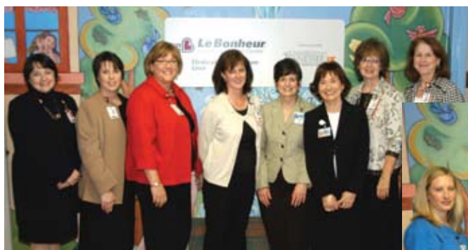
Administrators and nurses from Le Bonheur Children's Medical Center and the UT Health Science Center College of Nursing gathered in November 2009 to unveil two new Dedicated Education Units.