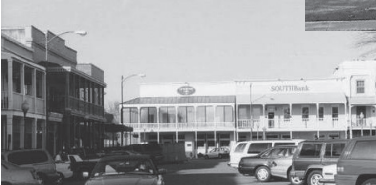
Downtown Grill, Oxford Square