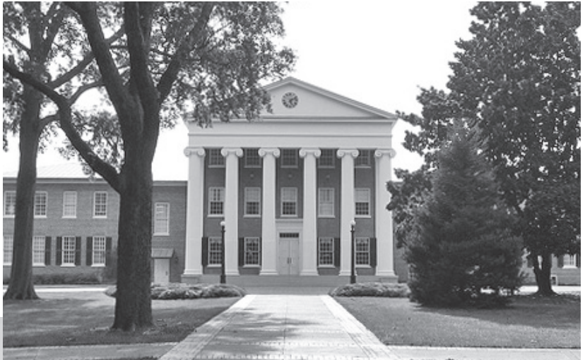
Lyceum Building, University of Mississippi