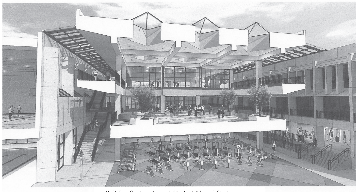
Building Section through Student Alumni Center