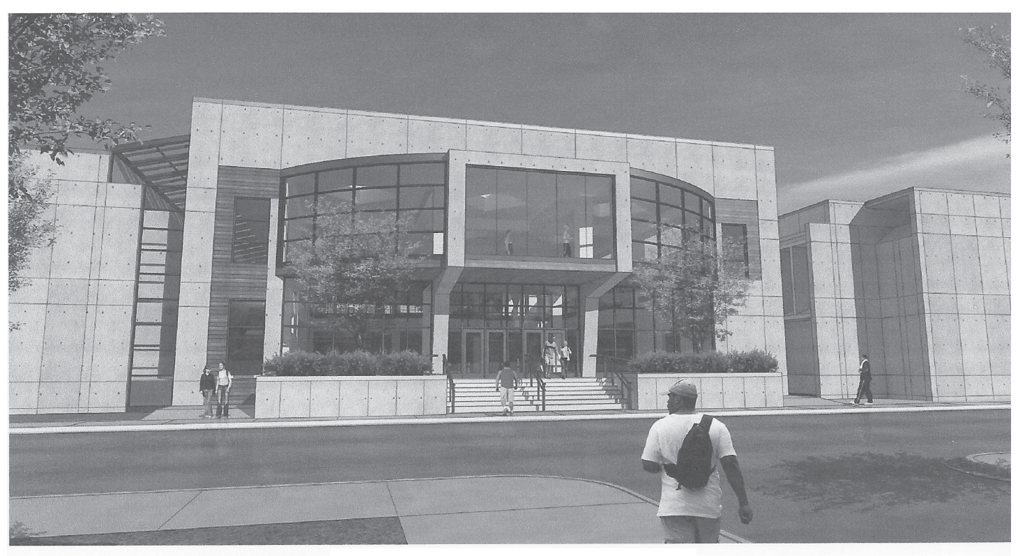
Main Entrance from Manassas Street