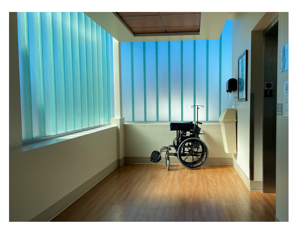
Memphis VA Medical Center, Memphis, TN

Hard times lie ahead. Ready or not, here I come. I know not what waits.