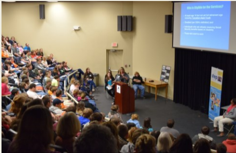
Self-Determination and Transition