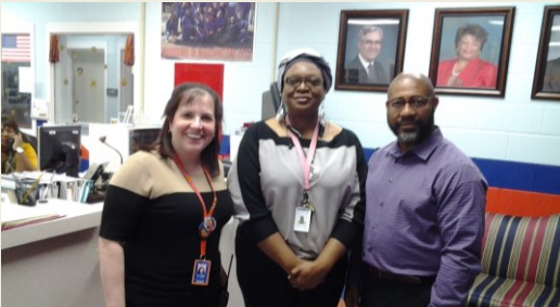
Self-Determination and Transition