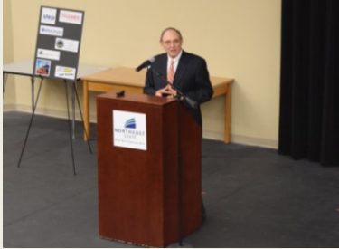
Self-Determination and Transition