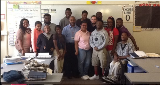
Self-Determination and Transition