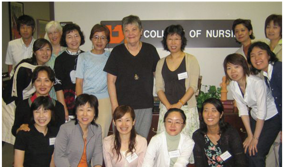
Participants in the Newman's Dialogue on Health as Expanding Consciousness included a number of Japanese visitors:

At the conclusion of the two-day conference, plans were made to form subsequent dialogue meetings in Japan and at other scientific meetings in the United States to advance the application of HEC in nursing practice. For further information go to www.healthasexpandingconsciousness.org .