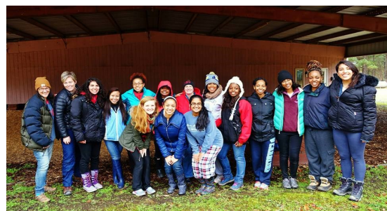
The MHIRT 2015 Team at the Heffer Ranch in Perryville, Arkansas

If you have any questions about the program, please send inquiries to mhircbu@gmail.com or visit http://www.cbu.edu/mhirt