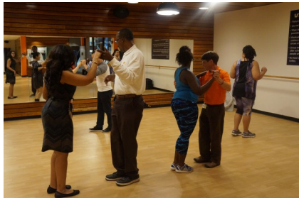
National Hispanic Heritage Month Salsa Lessons